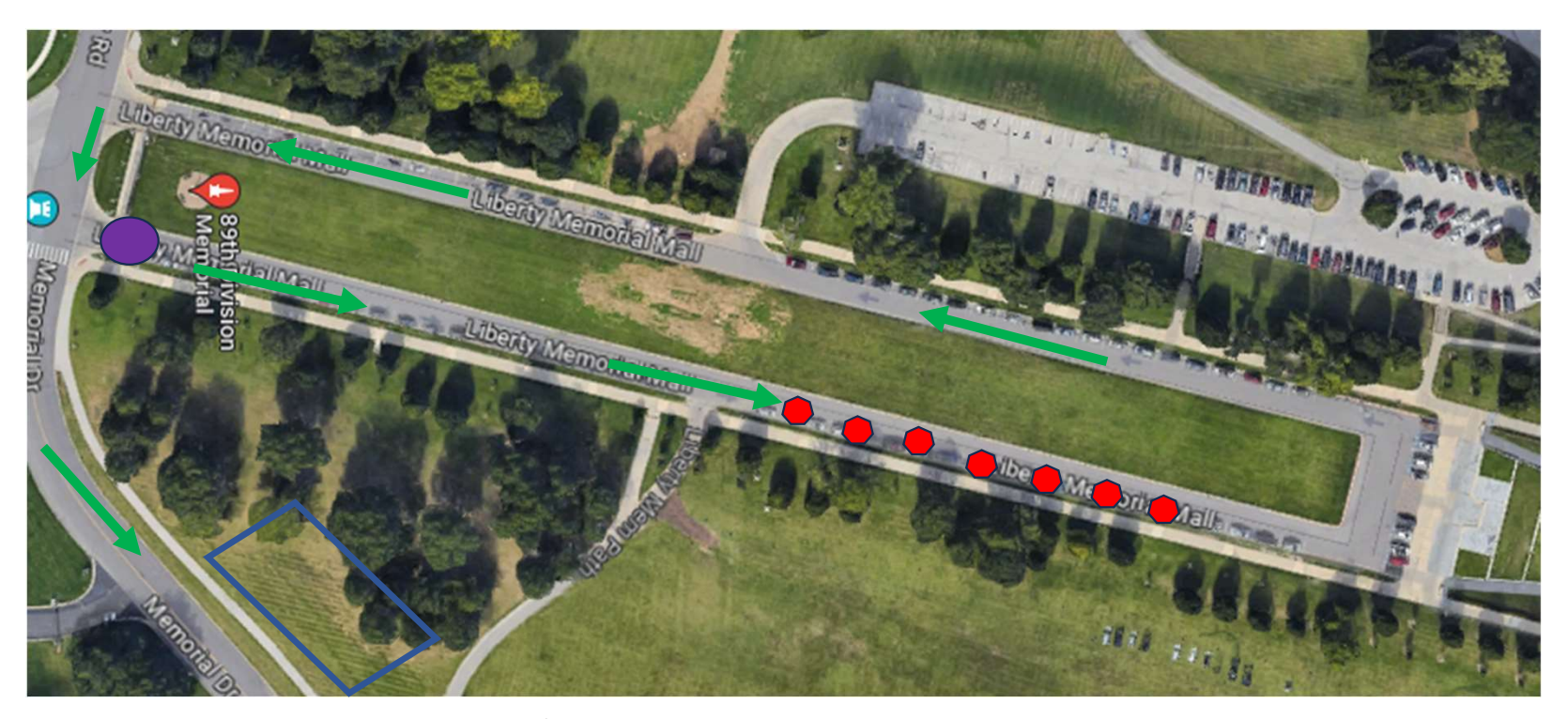
Starting point is the Purple Circle! You will follow the green arrows around the Mall Purple Circle – check in for drop off and registration Stop signs are drop of points for supplies

Once you register and then drop off supplies you will then park. Each VSO will have 1 parking spot on the grounds in blue trapezoid. For parking, you will exit the mall and then go out for parking. Following the path of the Green arrows. DO NOT PARK without checking in first, you can forgo the unload area but checking in first is necessary for parking pass or transportation pass. See additional Info for extra parking.